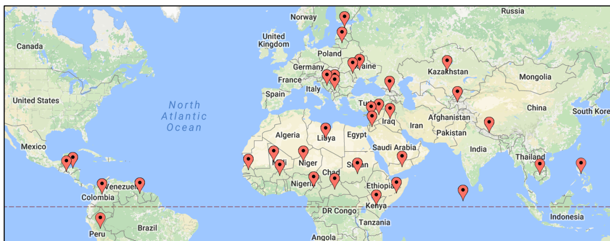
Spirit of America Project locations, 2016

Throughout the course of 2016, Spirit of America's all-veteran field team designed and implemented 94 projects in 34 countries.