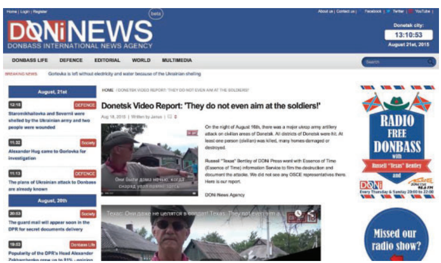
Screenshot from the DoniNews website, which publishes articles praising the separatists and criticizing Ukraine and the West.

"Clever social policies and better standards of living, not ideological propaganda, will reintegrate the Donbas and Crimea with Ukraine."