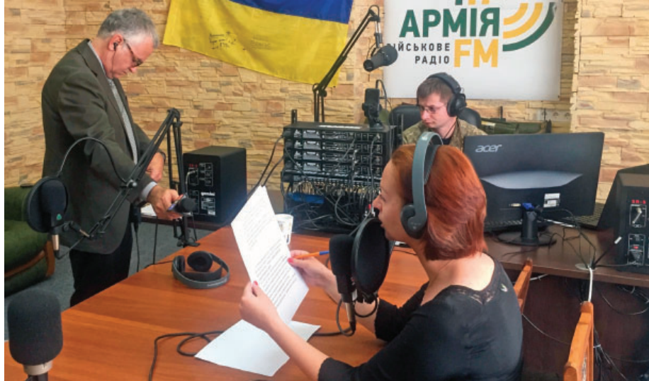
ArmyFM live on the air in Kiev, Ukraine.