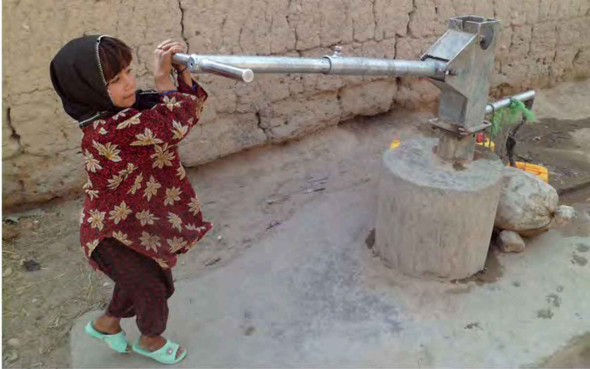
An Afghan girl pulls on a water pump installed by Spirit of America at the request of Navy SEALs working near her remote mountain village.