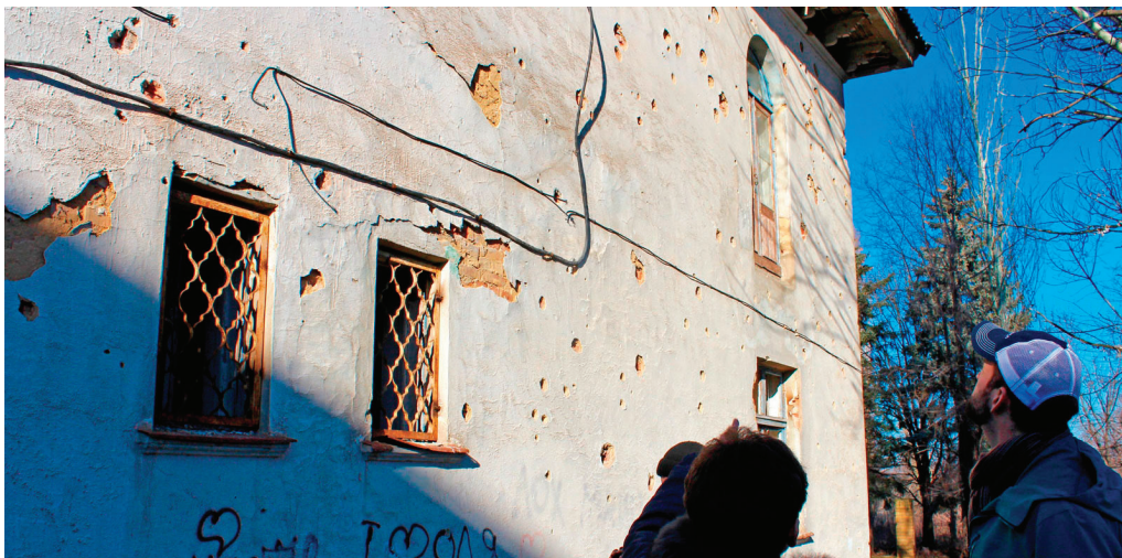
The headmistress pointed out pockmarks from shrapnel that dotted the building.

Fixing up the school is part of an ongoing battle for the hearts and minds of a people whose ethnic ties are with Russia but whose military and leaders identify with the West.