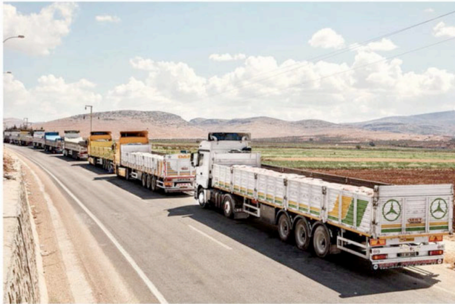
Near the border crossing to Syria outside Antakya, Turkey. Trucks trying to pass through can wait days to reach the checkpoint.

estate, he was caught forging a document trying to help a man cut through red tape and get his land back from the government. During the two months he spent in prison, he was disturbed by the torture to which political prisoners — although not common criminals like him — were subjected.