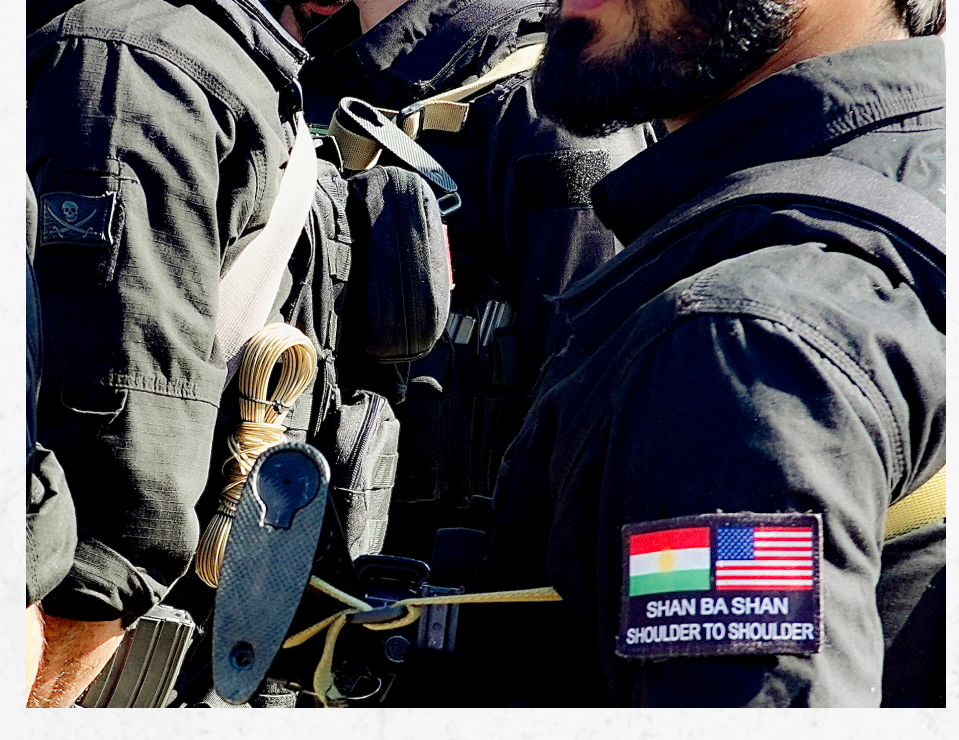
Shoulder patches tell the story. Peshmerga stand and fight-often with Americans next to them.

funding with the Kurds, but almost no support makes its way north. So most of the Peshmerga arms are things they have captured in battle. In the courtyard of this base I count 15 U.S. armored humvees plus some other heavier and lighter tactical vehicles. All of these had been given to the Iraqi Army, but then abandoned when ISIS forces attacked. The Peshmerga captured them back and now husband them carefully. The small well-organized arsenal is likewise full of recycled weapons.