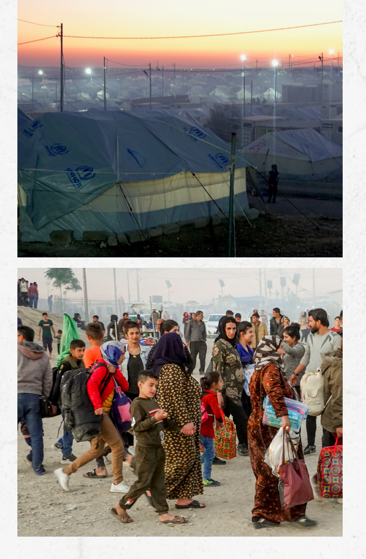
Another day ends for 14,000 refugees sheltered in a Kurdistan camp (top). Syrian Kurds in flight from Turkey's invasion, having entered Iraq the day before, flood into the Bardarash refugee camp carrying all their remaining worldly possessions (bottom).

south, the services and infrastructure are barely changed since the days of Saddam—a terrible mess!"