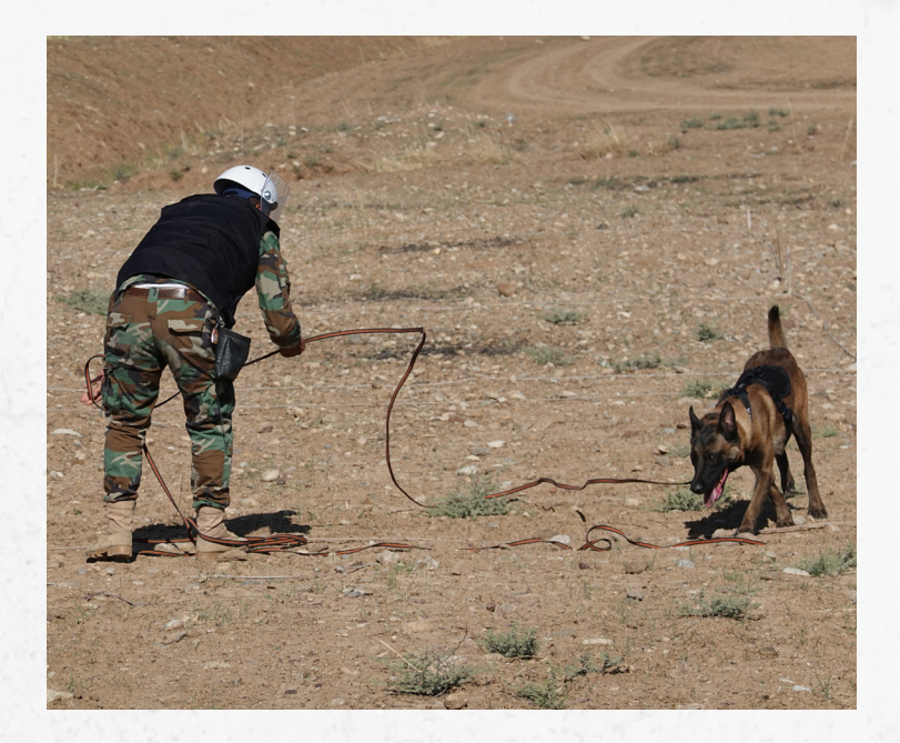
The highly trained explosive-sniffing Belgian Malinois named Max works a plot, seeking dangerous landmines that even metal detectors can't find.

One of Brandon's latest projects for Spirit is now on display for me. Thanks to some generous American philanthropy that took place before Spirit got involved, Kurdish security forces have built up a valuable K9 corps for detecting explosives. During their fight to expel the Islamic State, 60 percent of the casualties suffered by Kurdistan's Peshmerga military force were inflicted by landmines or buried explosive devices. Many