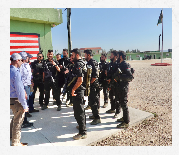
A platoon of elite Peshmerga commandos ring three Spirit of America staff to talk about future collaborations.

on pieces of chicken shredded and placed on their plates by hand by the Major as his sign of hospitality. Everyone in the room seems comfortable.