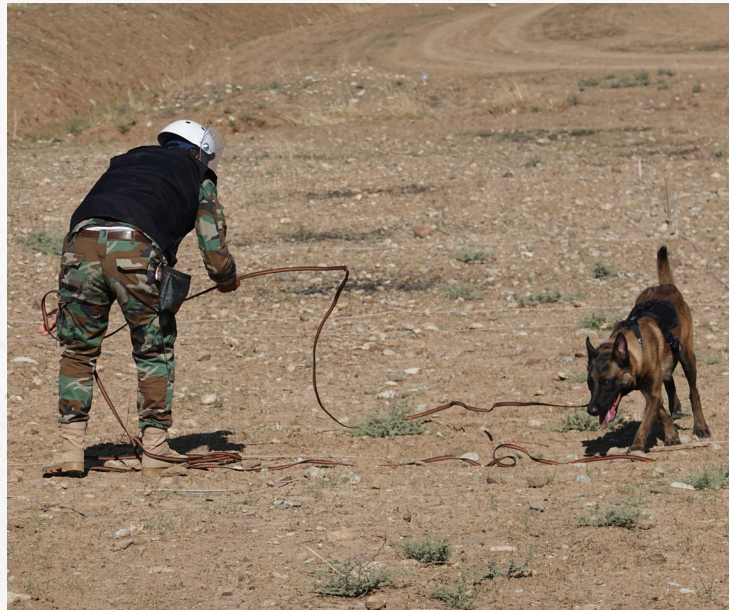
The highly trained explosive-sniffing Belgian Malinois named Max works a plot, seeking dangerous landmines that even metal detectors can't find.

One of Brandon's latest projects for Spirit is now on display for me. Thanks to some generous American philanthropy that took place before Spirit got involved, Kurdish security forces have built up a valuable K9 corps for detecting explosives. During their fight to expel the Islamic State, 60 percent of the casualties suffered by Kurdistan's Peshmerga military force were inflicted by landmines or buried explosive devices. Many