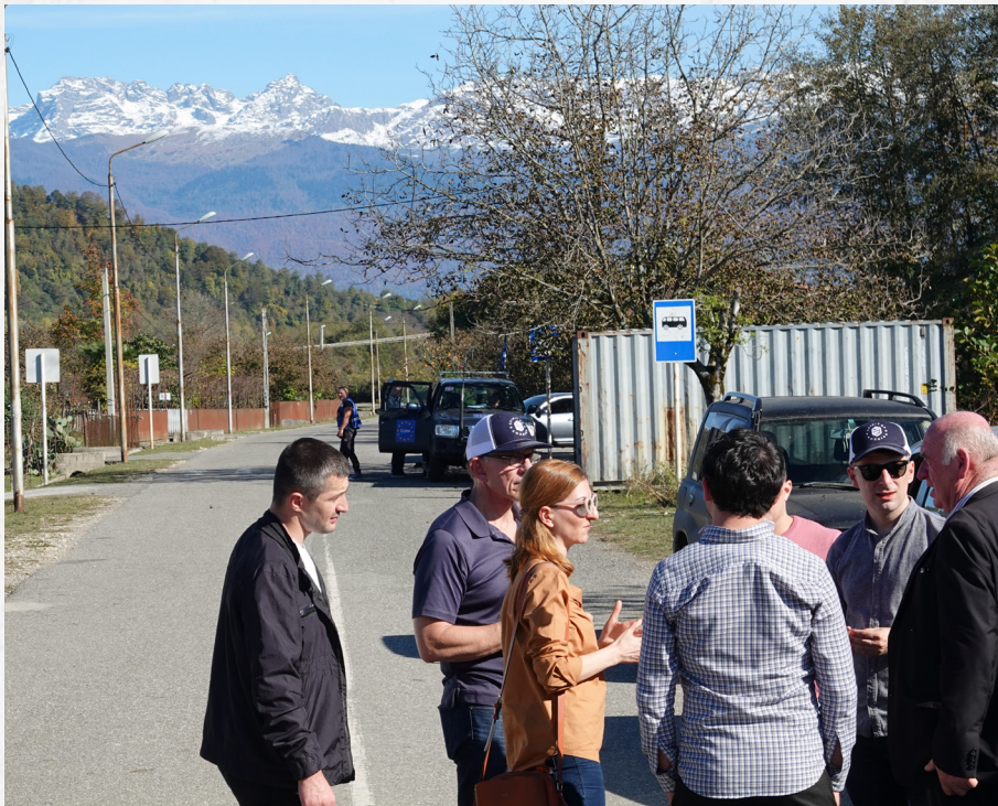
At the boundary with Abkhazia, a province of Georgia occupied by Russian troops , Pakhulani's schoolmaster, far right, talks with Spirit of America staff and security personnel, with European Union monitors in the background, and the Caucasus looming above.