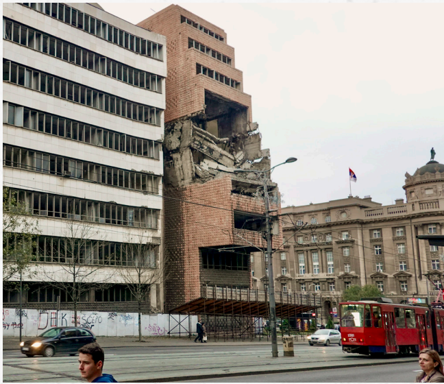
The bombed-out shell of its Ministry of Defense right in the heart of Belgrade has been preserved by the Serbian government as a tool to keep resentment alive against the U.S. for its opposition during the Balkan wars.

out to Serbs through U.S. civil society instead of government—specifically through Spirit of America. The charity has recently invested more than $50,000 in small projects across the country, laying groundwork for a gradual person-to-person thaw in relations. Spirit’s main focus has been the south of the country, where Russia (protector of Yugoslavia during its warring phase, and vetoer of any international efforts distasteful to the old regime) has concentrated its own efforts to influence Serbian opinion and governance.