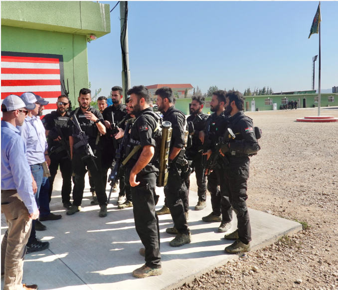
A platoon of elite Peshmerga commandos ring three Spirit of America staff to talk about future collaborations.

on pieces of chicken shredded and placed on their plates by hand by the Major as his sign of hospitality. Everyone in the room seems comfortable.