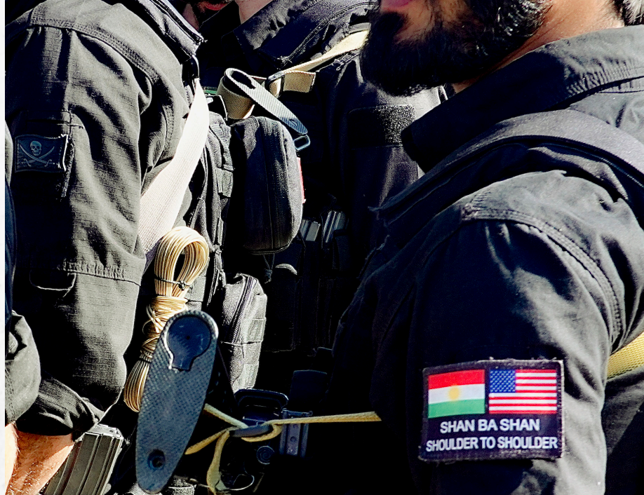
Shoulder patches tell the story. Peshmerga stand and fight—often with Americans next to them.

The Iraqi central government is supposed to share military equipment and