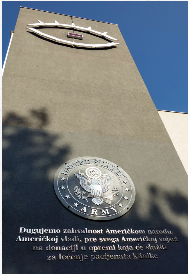
Tribute to U.S. aid on the cardiovascular clinic in Nis, Serbia.

“You cannot have a lower death rate than that among urgent patients,” he notes.