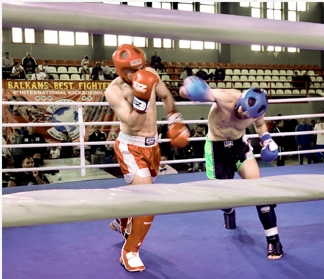
Fighters trained at the gym renovated by Spirit won honors at this year's Balkan kickboxing championship.

As we enter the “Balkan’s Best Fighters” auditorium, 400 competitors from Serbia, Bulgaria, Moldova, Hungary, Bosnia, Macedonia, and several other countries have already begun to face off. The youngest athletes are battling on mats covering a basketball court. A large roped ring hosts the older and most skilled fighters. Punches and kicks are flying.