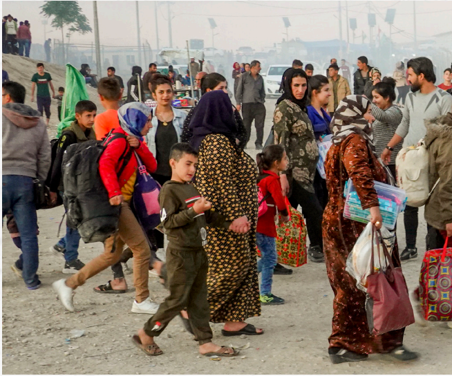
Another day ends for 14,000 refugees sheltered in a Kurdistan camp (top). Syrian Kurds in flight from Turkey's invasion, having entered Iraq the day before, flood into the Bardarash refugee camp carrying all their remaining worldly possessions (bottom).

south, the services and infrastructure are barely changed since the days of Saddam—a terrible mess!”