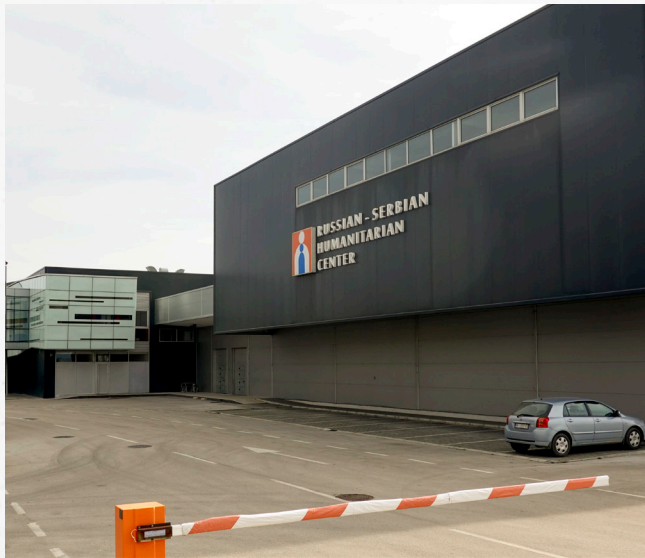
The “humanitarian center” Russia built in southern Serbia a few years ago appears to be anything but. It’s big and located in a strategic location, but visitors are forbidden and nothing visible happens here.

In a country where few professional sectors are anywhere near the cutting edge, the Nis clinic sparkles with modern efficiency. Last year it treated 12,000 patients for heart ailments alone, operating on 1,100 of them (many of those done by Milic himself). And among those 1,100 heart surgeries there were only 15 deaths.